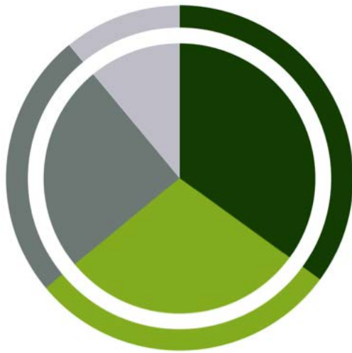
Student diversity by nationality in 2019